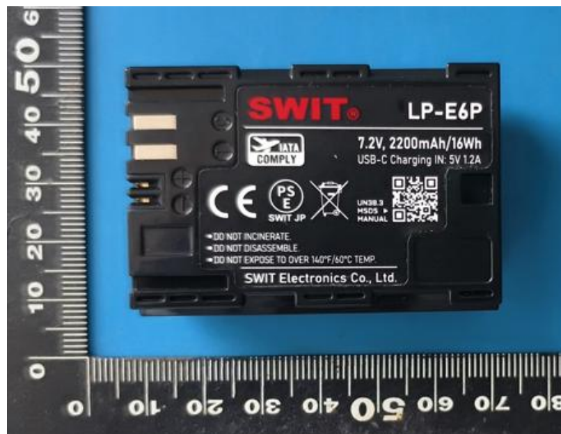
Fig. 2 – Back view of Power Bank 表2-电池反面视图